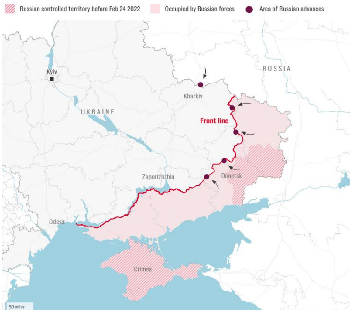
Figure 1: Territory Gained in Russian Offensive Operation