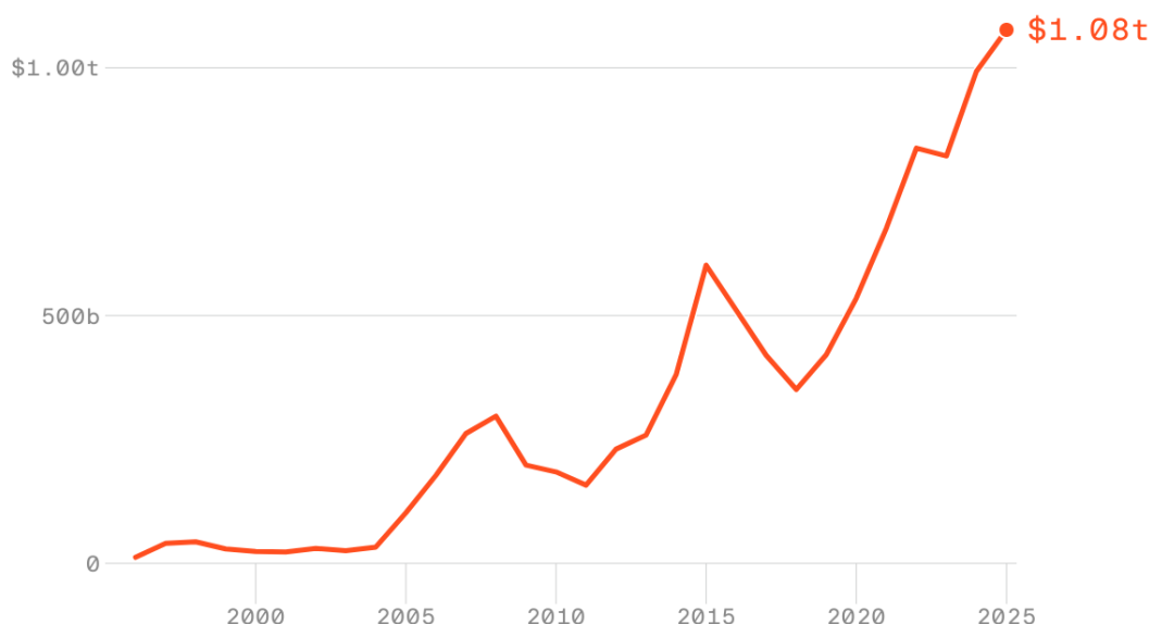
Figure 2. China's Global Trade Balance, Annually 1996-2024, 2025 Thru Nov