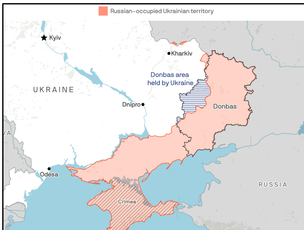
Figure 2: Military Control in Ukraine, Feb 16, 2026